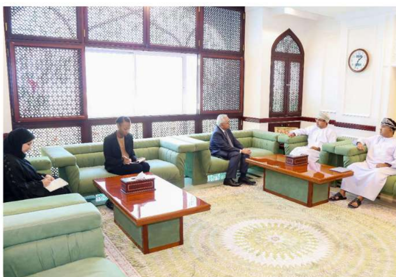
Meeting His Excellency Dr. Saud Bin Hamoud Al Habsi, Minister of Agriculture, Fisheries and Water Resources