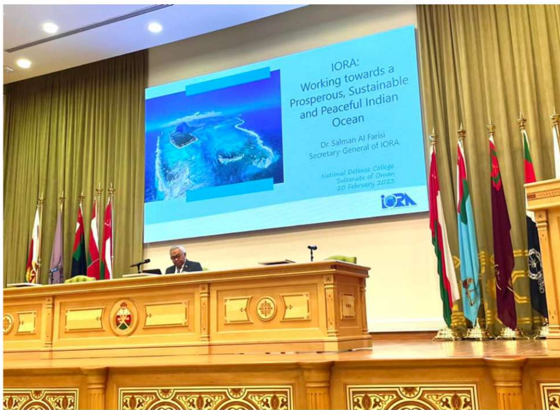
IORA's SG delivering his lecture at Omani National Defence College in Muscat

Upon the invitation from H.E. Badr Bin Hamad Bin Hamood Albusaidi, Foreign Minister of Sultanate of Oman, the Secretary General of IORA, H.E Salman Al Farisi delivered a lecture at the Omani National Defence College in Muscat. In this speech, the SG highlighted on the role of IORA to achieve a prosperous, sustainable, and peaceful of Indian Ocean.