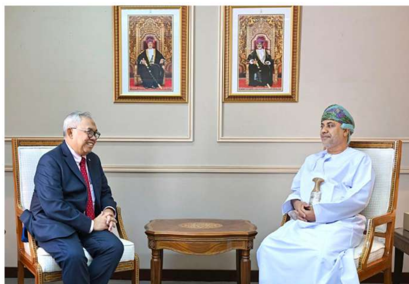
Meeting H.E Mohammed bin Nasser Al-Wahaibi, Undersecretary of the Ministry of Foreign Affairs of the Sultanate of Oman