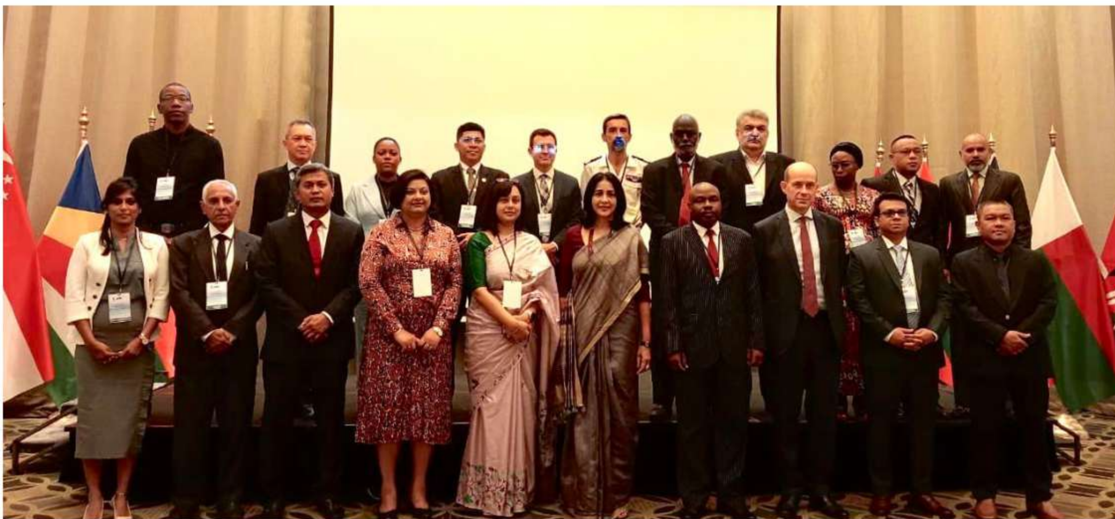
Photo: Heads of Delegates of Member States at the Inauguration Ceremony in Sri Lanka

There were participants from 19 IORA Member States (Australia, Bangladesh, France, India, Indonesia, Iran, Kenya, Madagascar, Malaysia, Maldives, Mauritius, Mozambique, Seychelles, Somalia, South Africa, Sri Lanka, Tanzania, Thailand and Yemen) who attended the event in Colombo, Sri Lanka.