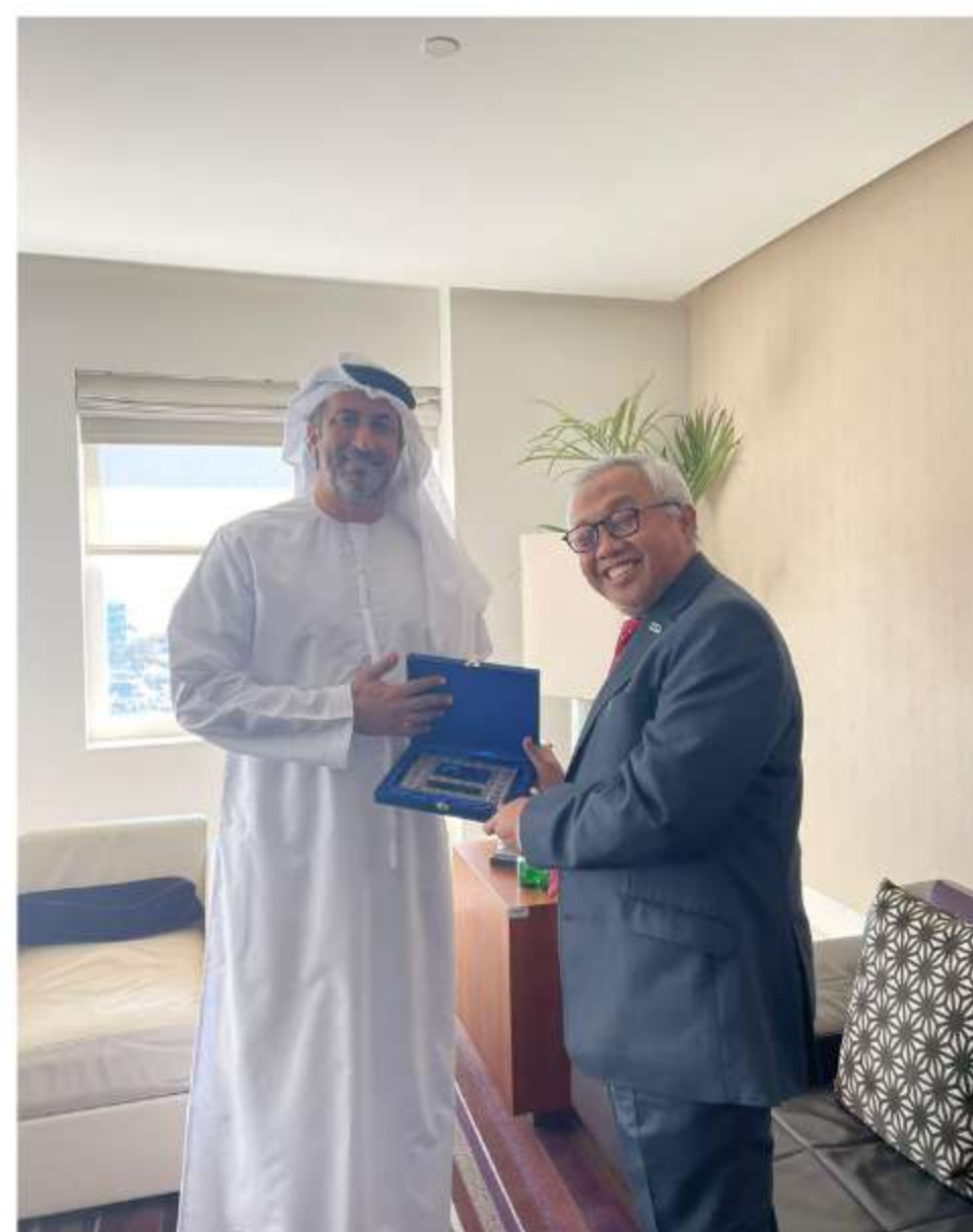
Meeting with H.E Saeed Mubarak Al Hajeri, Assistant Minister for Economic and Trade Affairs, Ministry of Foreign Affairs and International Cooperation