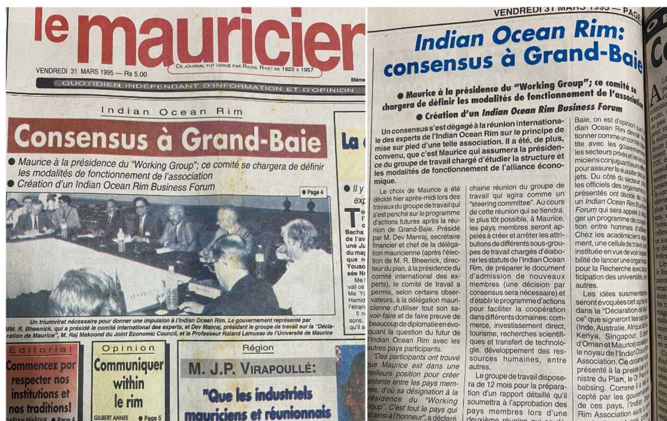
IORA in the news 28 years ago, before its establishment