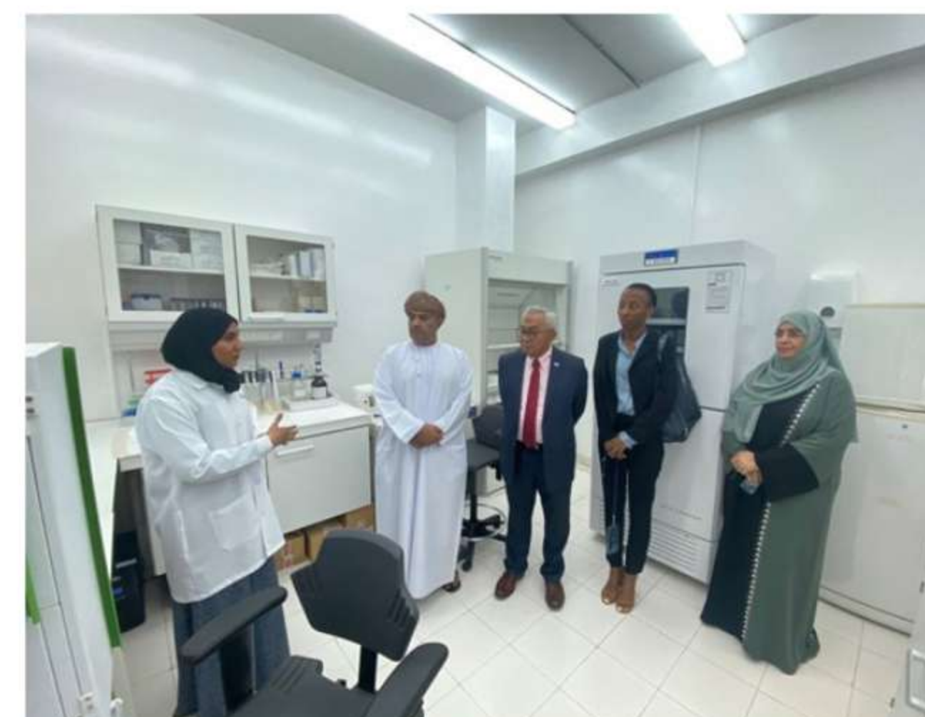
Meeting at the headquarter of the IORA the Fisheries Support Unit, specialized agency