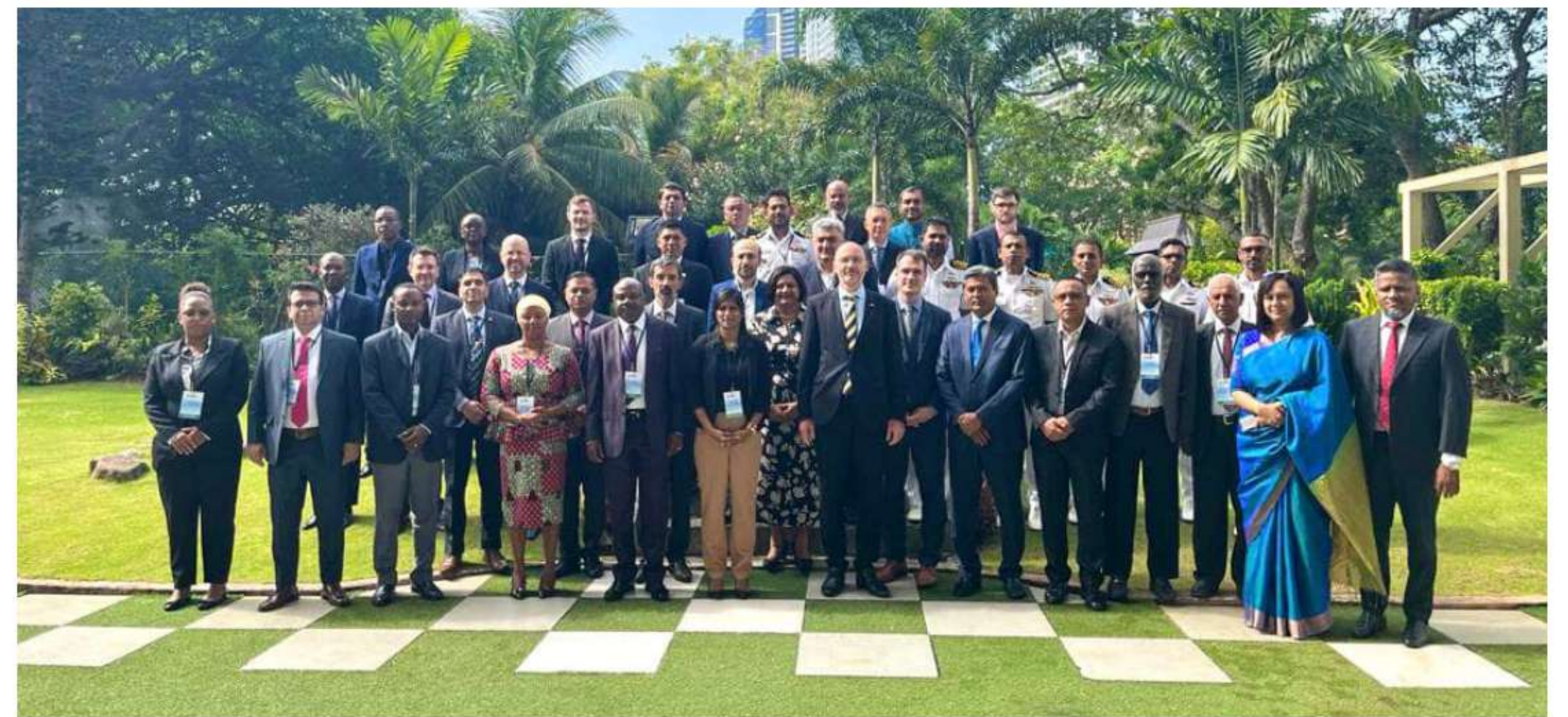
Photo: Delegates from IORA Member States at the Workshop on Cooperation for Maritime Security