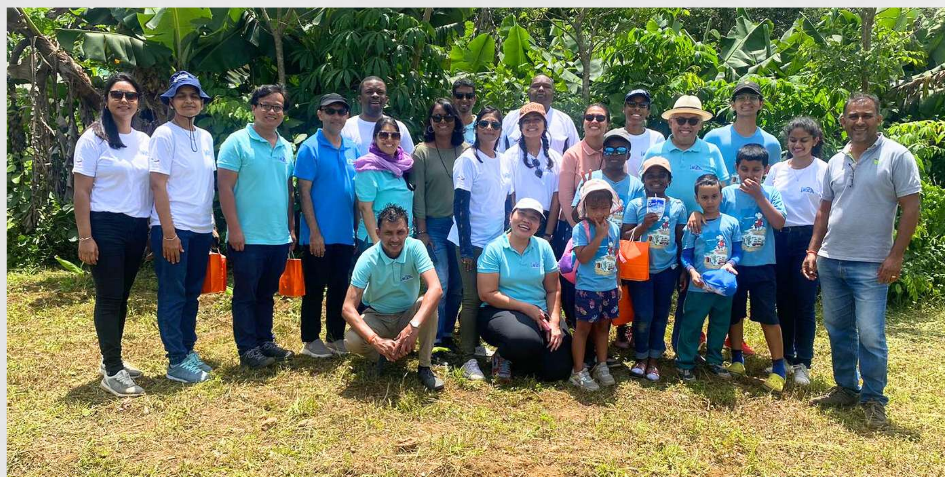
IORA Secretariat attended a community engagement programme on a corporate organic farming workshop by Farmbasket where kids joined the green fun! We got valuable insights into the world of organic farming and cultivating sustainable practices.