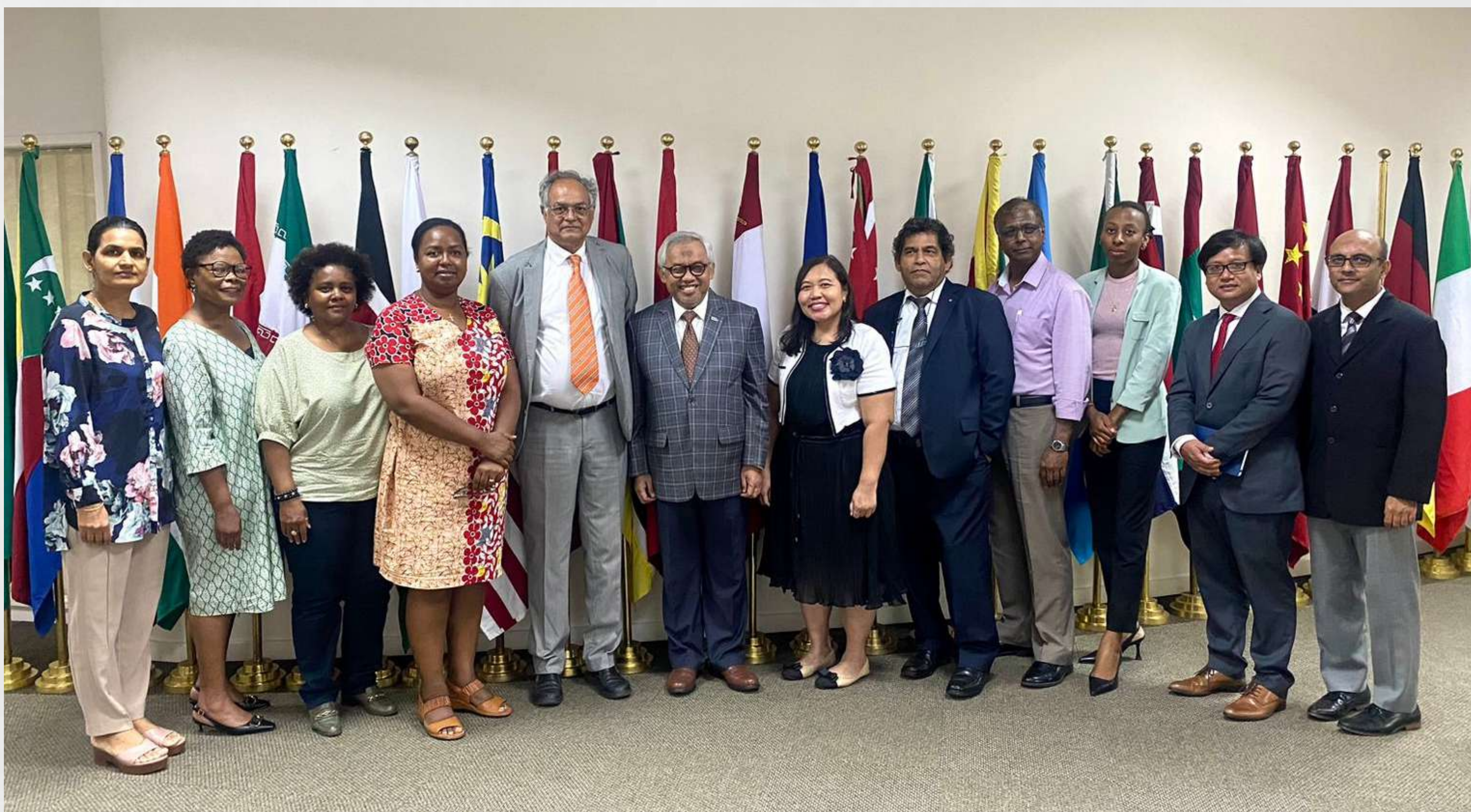
Brainstorming meeting at the IORA Secretariat in Ebene, dedicated to advancing the operationalization of the MoU between IORA and Indian Ocean Commission. The joint commitment of both Secretary-General highlights the importance of diplomatic cooperation and coordinating efforts for progress.