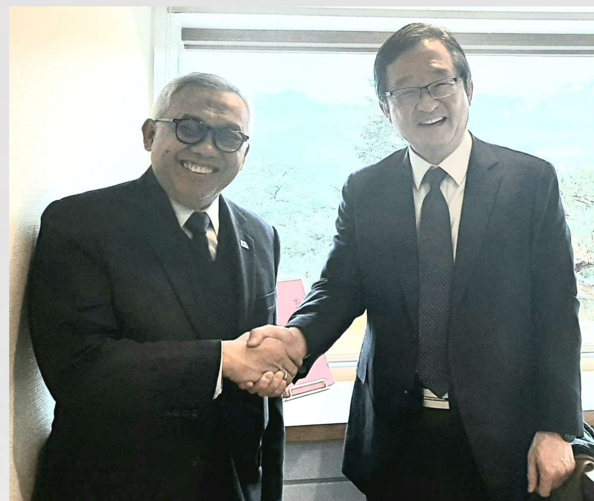
SG meeting with H.E. Mr. Chung Byung-won, Deputy Minister for Political Affairs of the Ministry of Foreign Affairs of the Republic of Korea (ROK), in Seoul, ROK, 15 December 2023