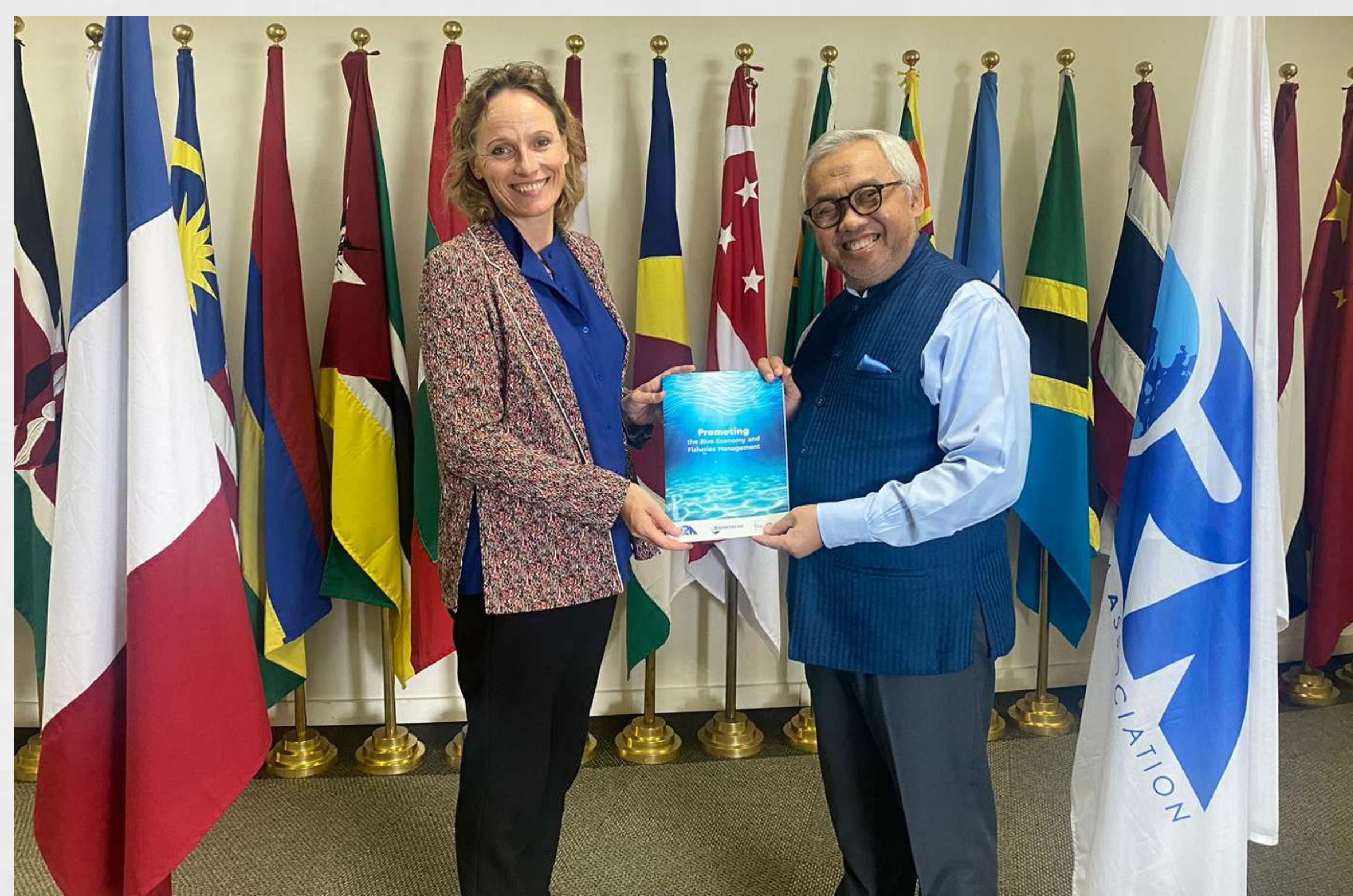
Launching of magazine: "Promoting Blue Economy and Fisheries Management" on 7th December 2023. The magazine reflects 3 years of cooperation between IORA and Ministry of Foreign Affairs of France through Agence Française de Développement with the support of COFREPECHE.